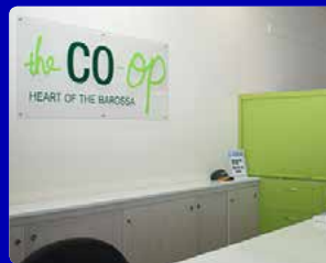
Barossa Co-op Betta Electrical, Department, Clothing, Sporting, Giftware