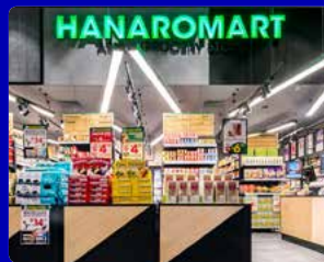
HANAROMART Asian Supermarket Chain