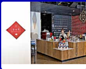
T Bar Rundle Place Cafe & Coffee Shop