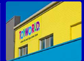
Toy World Children's Toys & Bikes