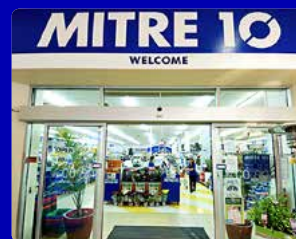
Mitre 10 Hardware & Trade Centre