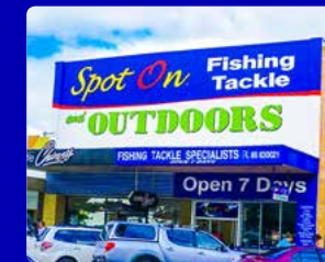
Spot On Fishing Sports, Fishing & Outdoors