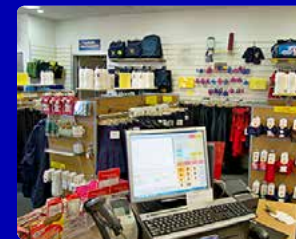
Trinity College School Clothing Store & Sports Store